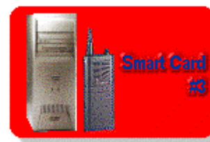
3. Contactless Microprocessor Card. A microcomputer + a radio transceiver

Smart cards will possibly be replaced worldwide by a universal multifunctional smart identification card (see Summary of the Planned Universal Control System ). The universal ID card may be followed by an implantable microchip, and many believe this will be the dreaded Mark of the Beast prophesied in the Scriptures (for related Bible passages see 1. Bible Prophecies About the Mark of the Beast ) to be introduced worldwide during the Apocalypse . The main reason we are writing these articles is to warn people of these dangers.