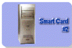
2. Microprocessor Card. A microcomputer