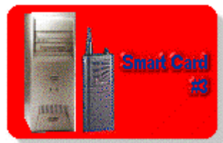
A microcomputer + a radio transceiver

Smart cards will possibly be replaced worldwide by a universal multifunctional smart identification card (see Summary of the Planned Universal Control System ). The universal ID card may be followed by an implantable microchip, and many believe this will be the dreaded Mark of the Beast prophesied in the Scriptures (for related Bible passages see 1. Bible Prophecies About the Mark of the Beast ) to be introduced worldwide during the Apocalypse . The main reason we are writing these articles is to warn people of these dangers.