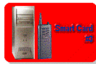
3. Contactless Microprocessor Card. A microcomputer + a radio transceiver

Smart cards will possibly be replaced worldwide by a universal multifunctional smart identification card (see Summary of the Planned Universal Control System ). The universal ID card may be followed by an implantable microchip, and many believe this will be the dreaded Mark of the Beast prophesied in the Scriptures (for related Bible passages see 1. Bible Prophecies About the Mark of the Beast ) to be introduced worldwide during the Apocalypse . The main reason we are writing these articles is to warn people of these dangers.