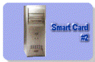
2. Microprocessor Card. A microcomputer