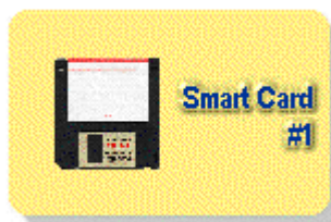
1. Memory Card. Floppy disk

These microprocessor-based smart cards are capable of performing multiple applications, such as identification, access control, financial, loyalty, health care and other applications. The pictures below illustrate what smart card capabilities really are.