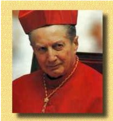
CARLO MARIA CARDINAL MARTINI

Will he be the next Pope? He is a Jesuit Priest as was Adam Weishaupt, of the Illuminati, he is one of only 7 Jesuit cardinals worldwide.