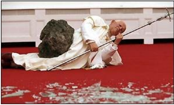
Pope-hit-by-meteorite sculpture auctioned for £620,000