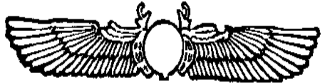
Egyptian symbol for the god ra.

Mazda is not the only automobile manufacturer to use ancient pagan god symbolism.