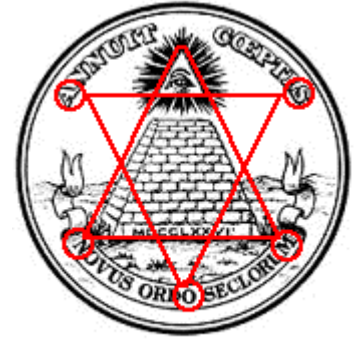
MASON = Freemason

the riddle. We will use EXACTLY WHAT THE BIBLE TELLS US: 600, 60 and 6. We will start with the REVERSE GREAT SEAL, the SEAL THAT DANIEL GAVE TO US. Embedded at the base of the PYRAMID ARE THE ROMAN NUMERICAL LETTERS: "MDCCLXXVI".